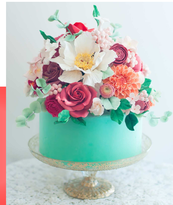
Photo here is not of actual cake handcrafted for tonight's lucky winner!

What garden party would be complete without cake? If this beauty magically disappears from your counter, smell your baby's breath... kids and adults alike find this treat irresistible! Box it up to enjoy in your own Secret Garden or make your table the envy of the room and enjoy it now.